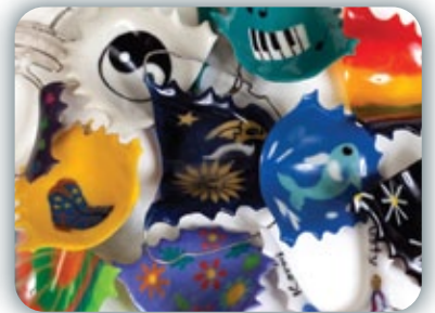
Custom Acrylic Options

Anterior and posterior pontics may be requested in most of our designs, or in your custom design. Just indicate shade preference and we can match the shade with precision. Tissue compatible opaque acrylic may be requested to enhance the fit and blending of the pontic against the patient's contour.