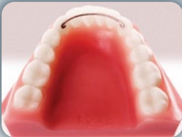
3-3 with Eyelets