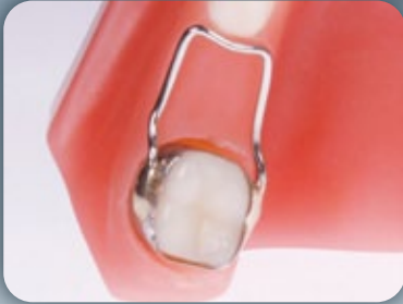
Band and Loop