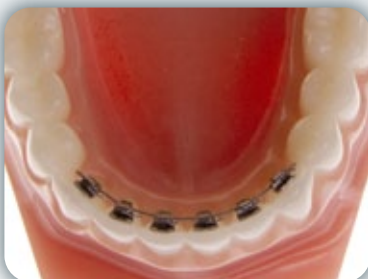
Social 6 - Lower